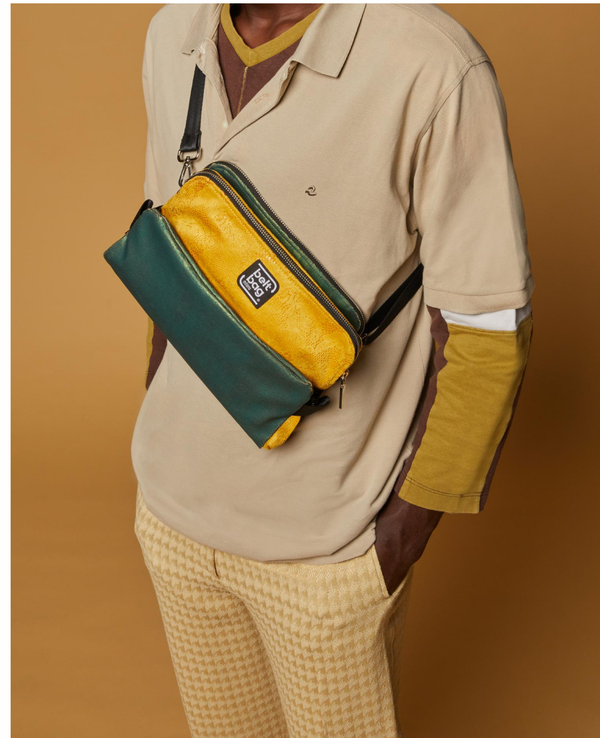
COMBO SB + POUCH