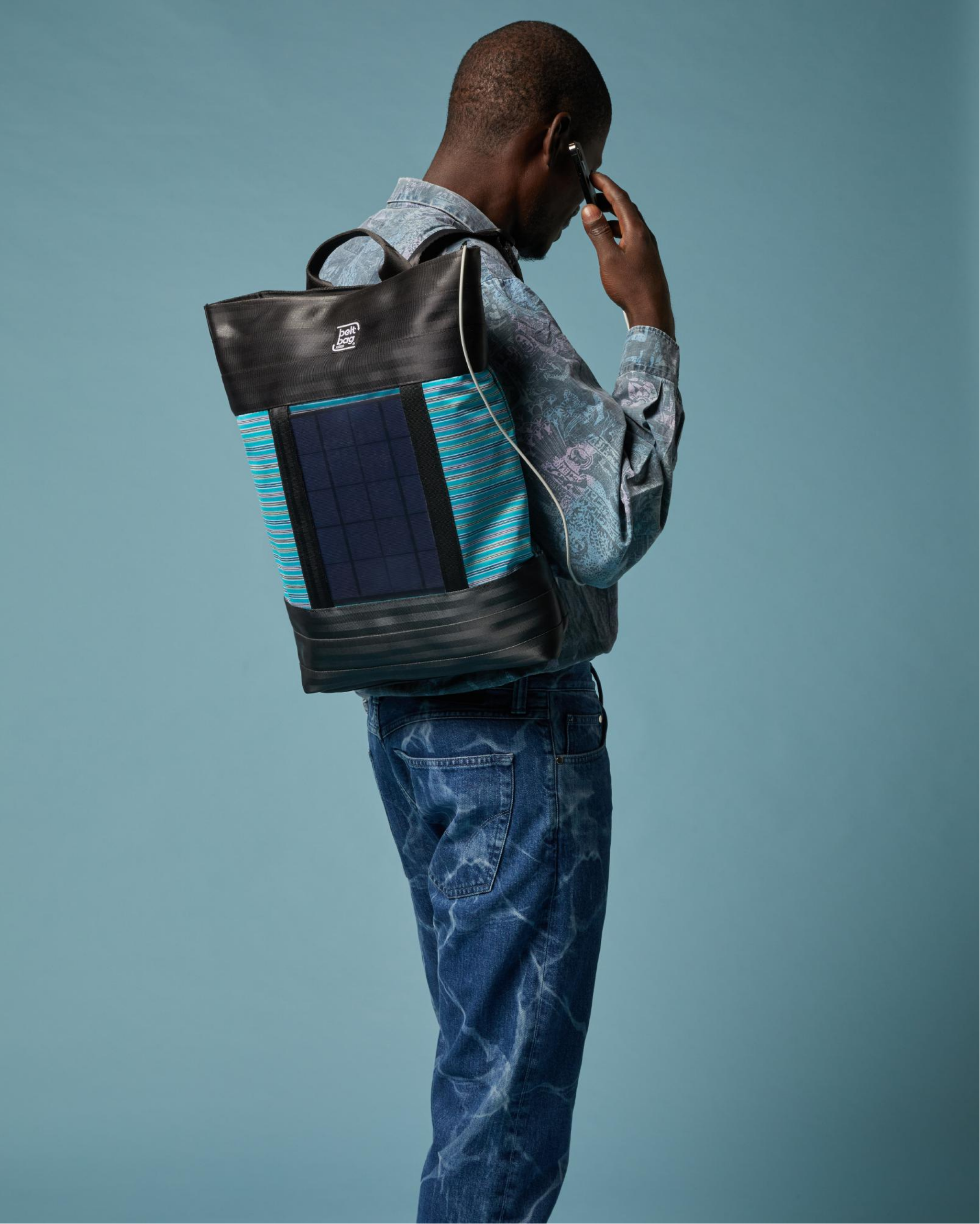
SOLAR TRENDY TR